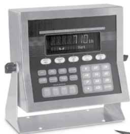
Sloped face model shown